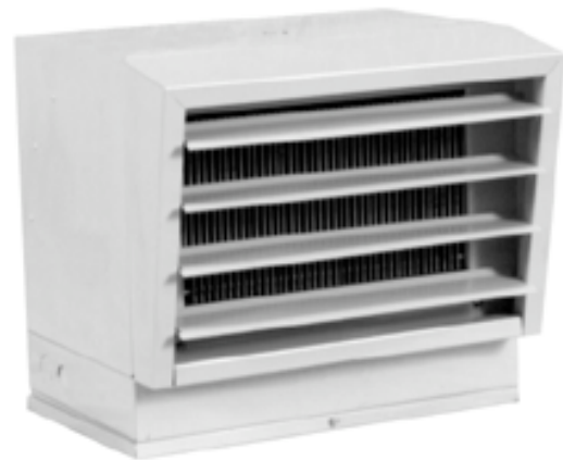
10 & 30 KW