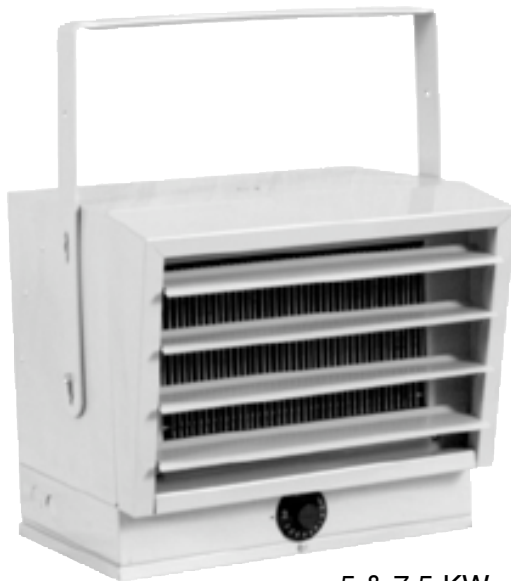
5 & 7.5 KW